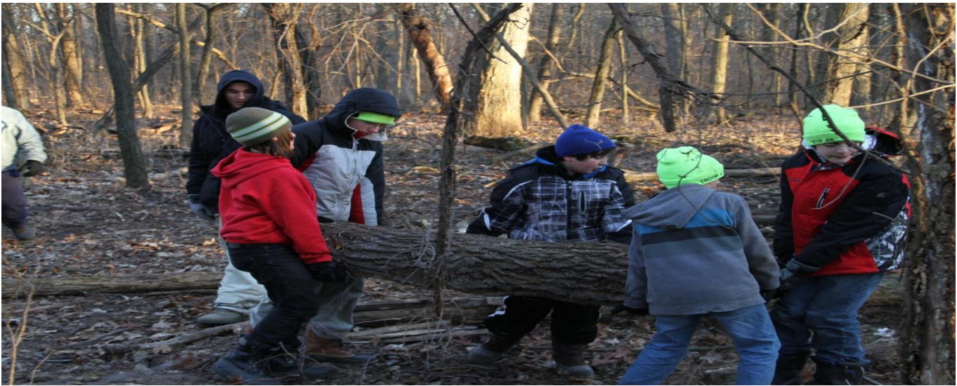
Scouts at Chief Shabbona Forest Preserve build survival shelter for a cold night outside