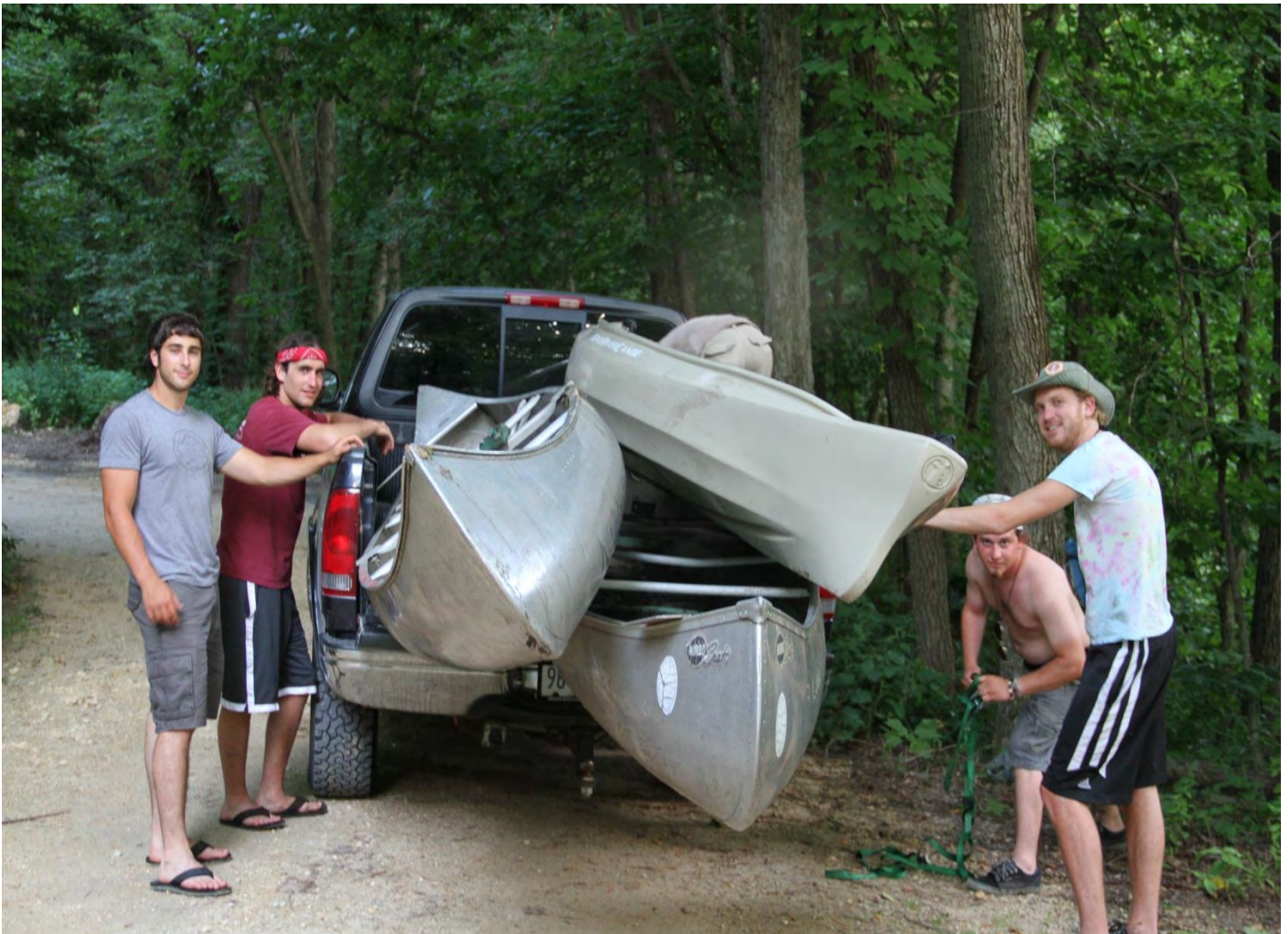
Many people kayak or canoe on South Branch of the Kishwaukee River (pictured is a group at the Russell Woods canoe landing).

Natural Resource Center Educational Staff teaching Fall school groups at Russell Woods. 1835 Miller -Ellwood Cabin work will continue with windows, doors and floor. Other projects include maintenance shop improvements and corn crib new sliding doors being installed at the Hoppe Farmstead, new firewood shed at Sannauk and Afton road entrance improvements and toilet rehab at Afton . Summer and Fall work, new metal roofs on Russell Woods and Nehring shelters, replace old storage garage at MacQueen with new steel garage, shelters painted at Shabbona and MacQueen, Lodge at MacQueen and house painted at MacQueen, and old Pierce Town Hall painted and repaired at Merritt Prairie. Steel roof on shelter at Shabbona, Footbridge washout areas at MacQueen connecting Potawatomi Woods repaired. Annual PDRMA Risk Management and Loss Control review went well and preparing for 2014 compliance . Improved tile drainage at Potawatomi Woods for adjacent cropland completed. Eagle scout projects at MacQueen forest preserve include new campfire ring, toilet improvements and trail improvements.