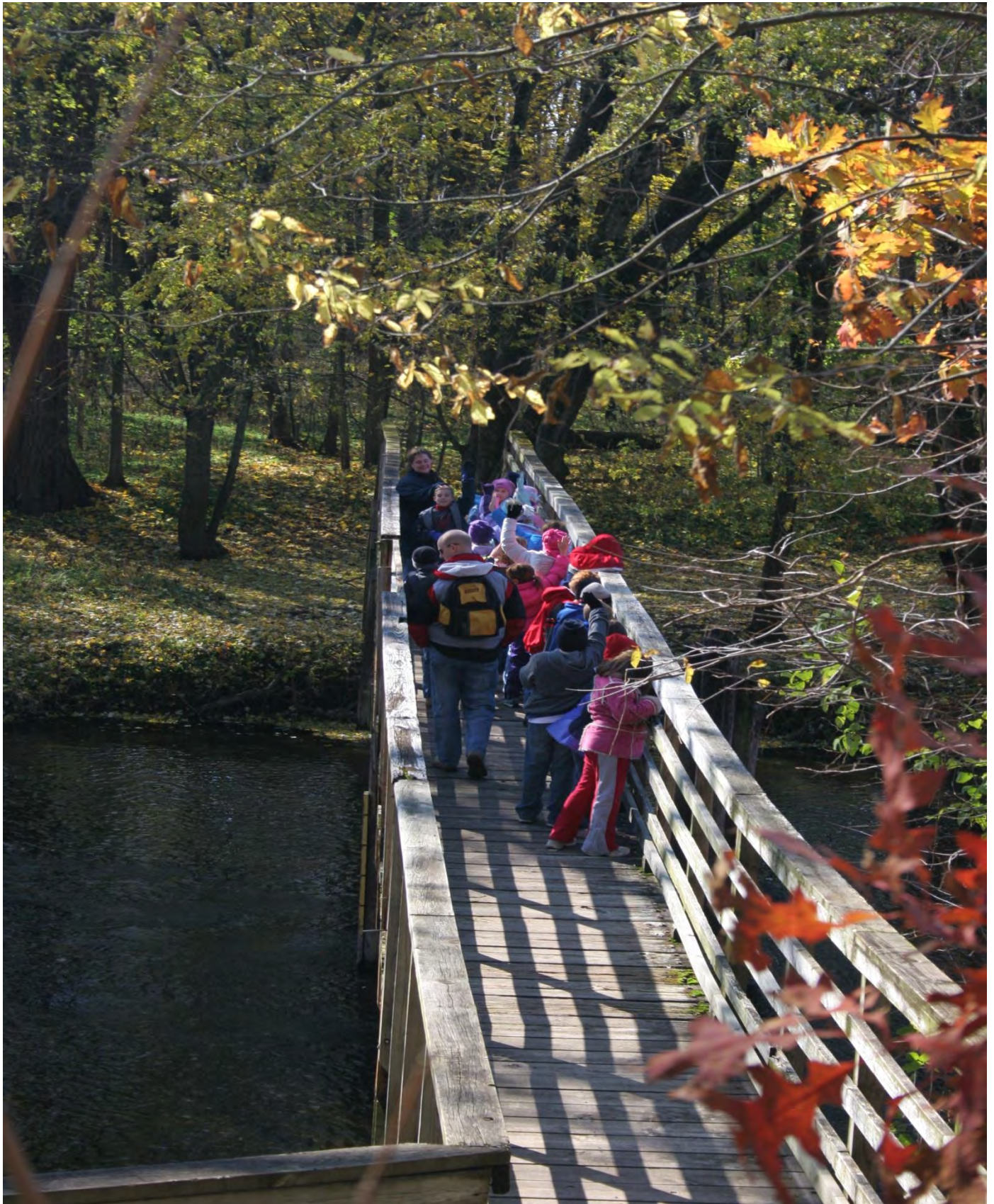
Autumn environmental education classes at Russell Woods and Afton