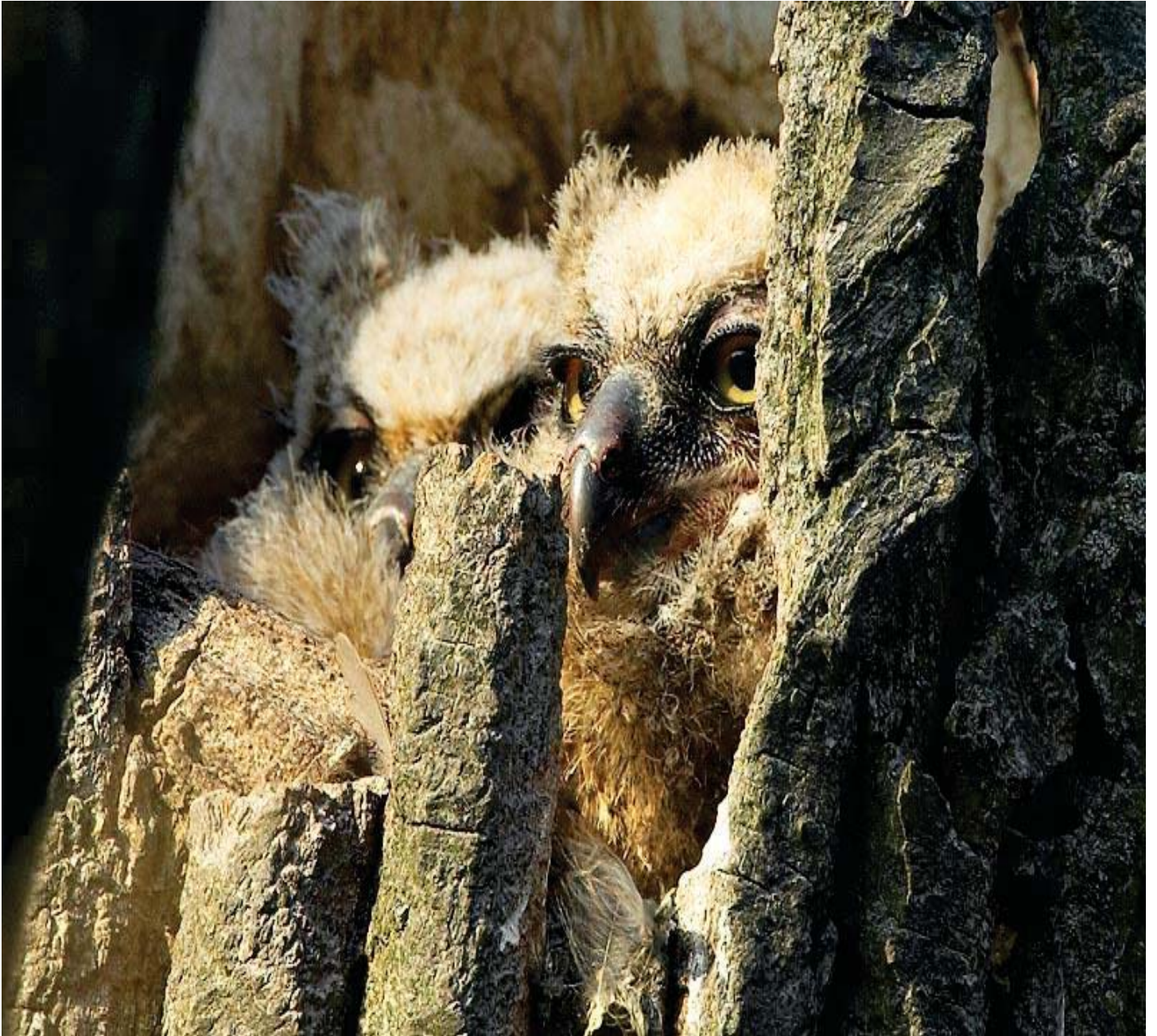
Great Horned Owl chicks on the nest at Wilkinson Marsh