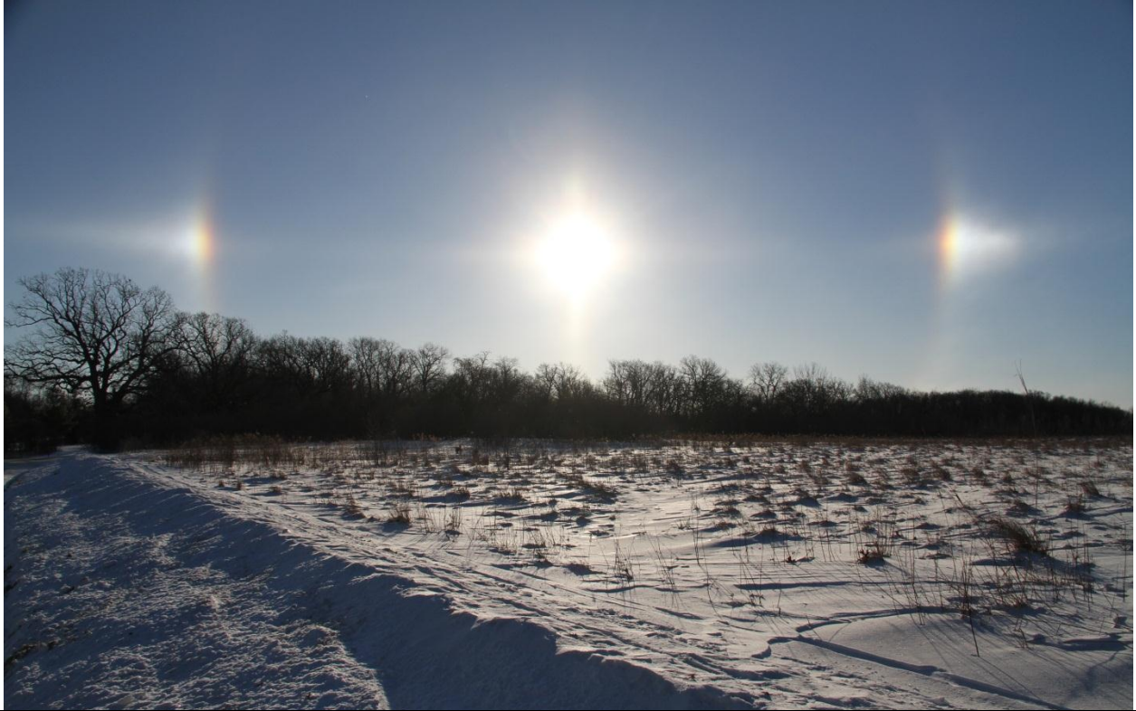
“Sun Dogs” a reflection of sunlight off the ice crystals in the clouds. It's a common atmospheric phenomenon in the Arctic, but in DeKalb County lately it isn't all that different from the Arctic. This photo was taken in DeKalb County one bitterly cold January morning.