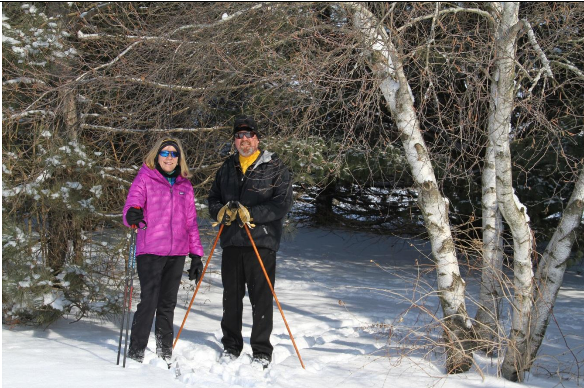
Cross –country skiers enjoy the trails at Afton and other forest preserves