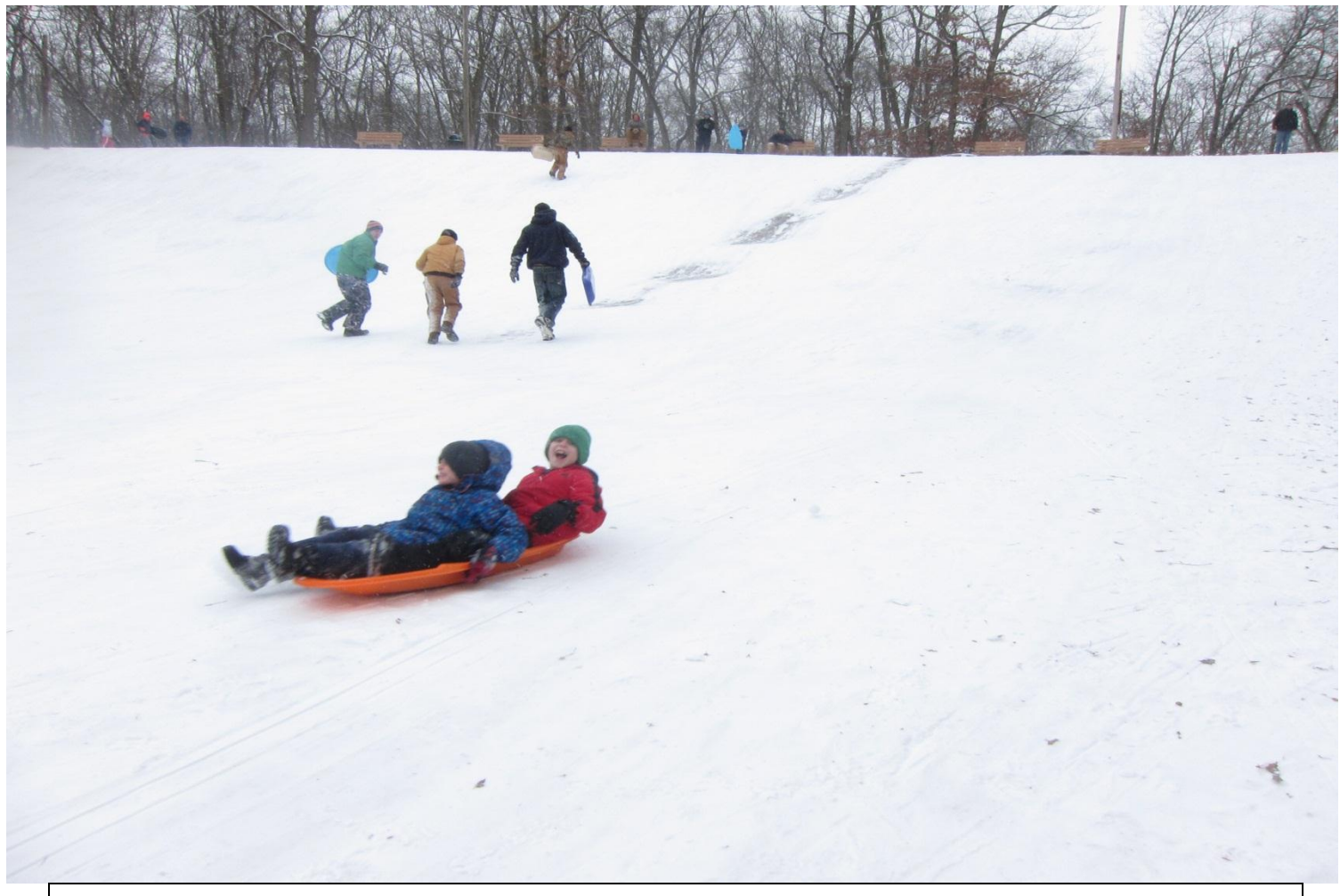
Sledding at Sannauk and Russell Woods Forest Preserves