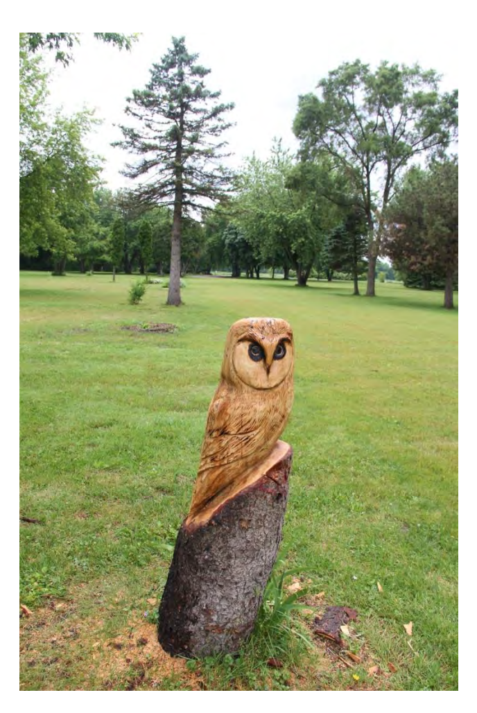
When dead trees were removed at Sycamore Forest Preserve, some of the stumps were left for wood carvings. Forest Preserve maintenance staff Bob Knuuttila, does beautiful wood carvings...pictured is an owl carved from a tree stump. Below: 200 large limestone boulders were placed along future roads and parking areas at Sycamore Forest Preserve to keep vehicles off grass and prairie areas.