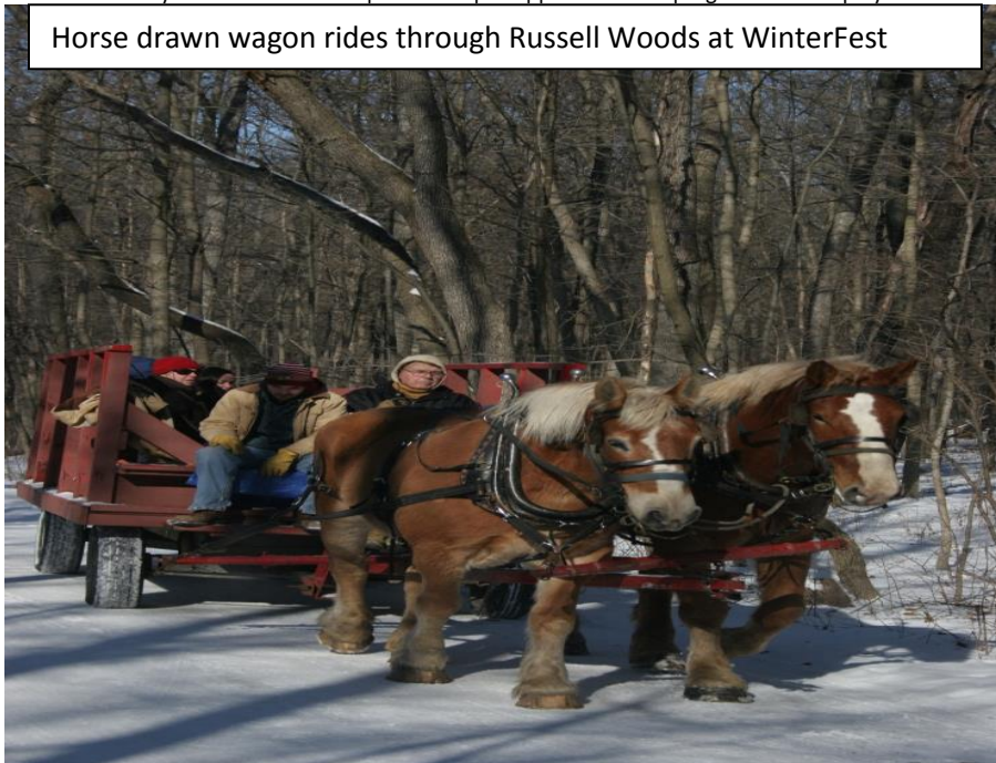
Horse drawn wagon rides through Russell Woods at WinterFest

University of Illinois Extension provides equal opportunities in programs and employment.