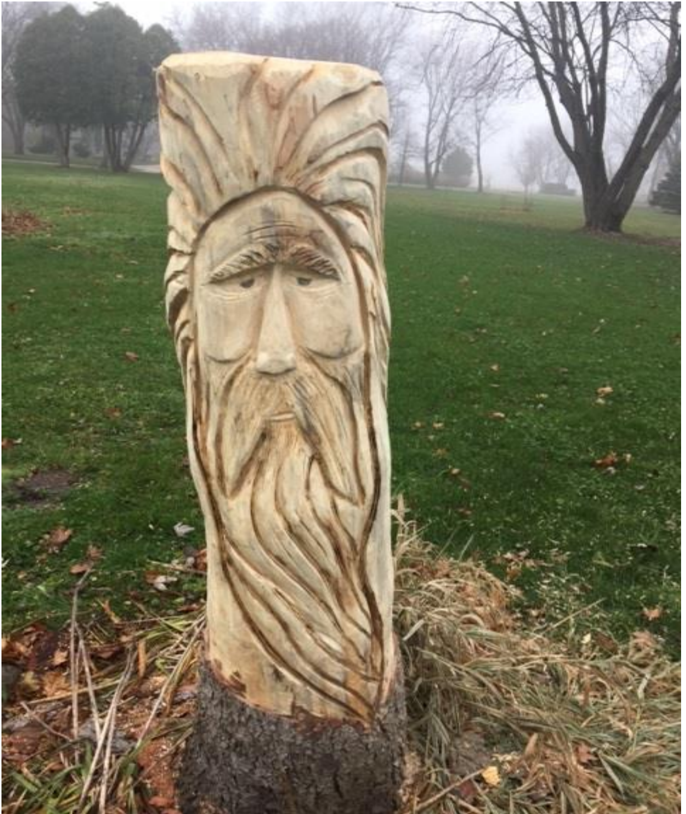
Also at Sycamore Forest Preserve, forest preserve maintenance staff Bob Knuuutila carved another one of his beautiful forest preserve "stump art" chainsaw wood carvings. (a Black Bear carving is in progress and will join his owl and morel mushroom wood carvings )