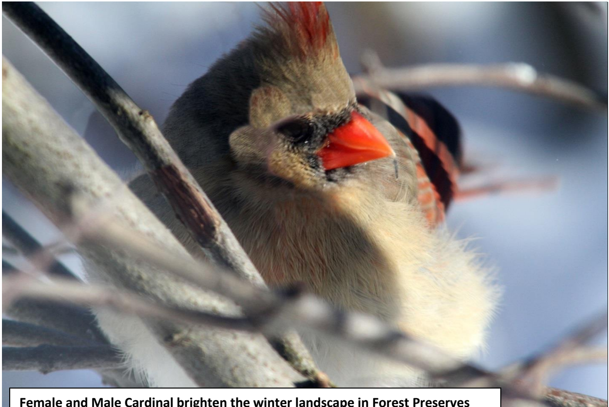
Female and Male Cardinal brighten the winter landscape in Forest Preserves