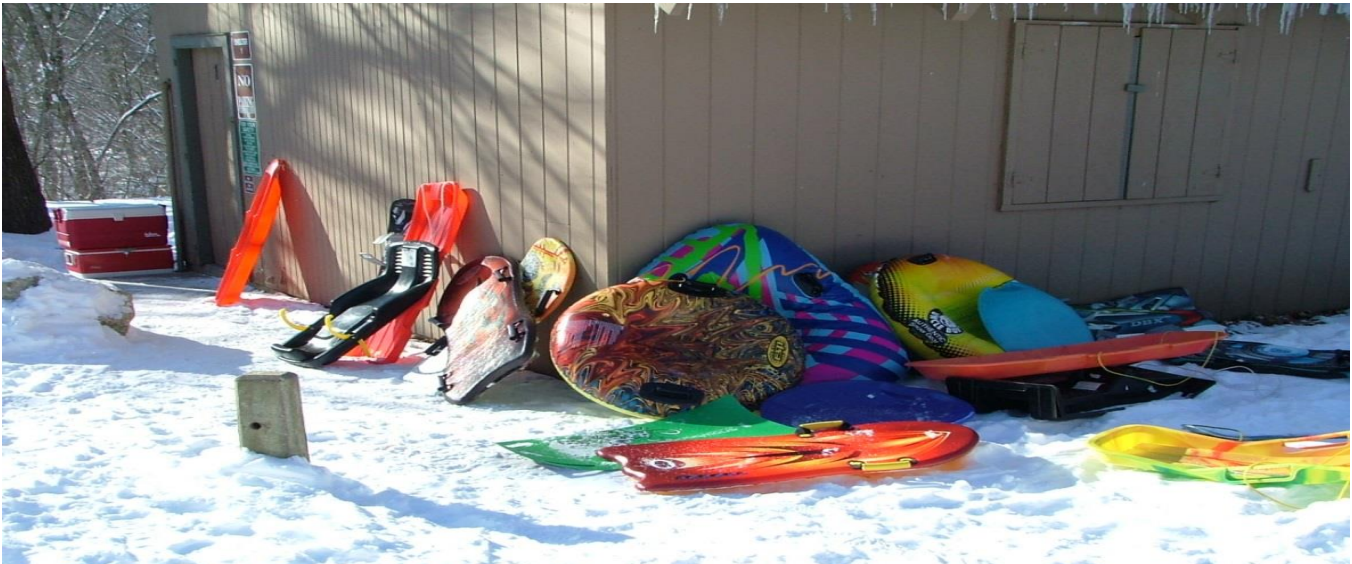
When winter conditions are good, sledding at Russell Woods and Sannauk is a popular winter activity.