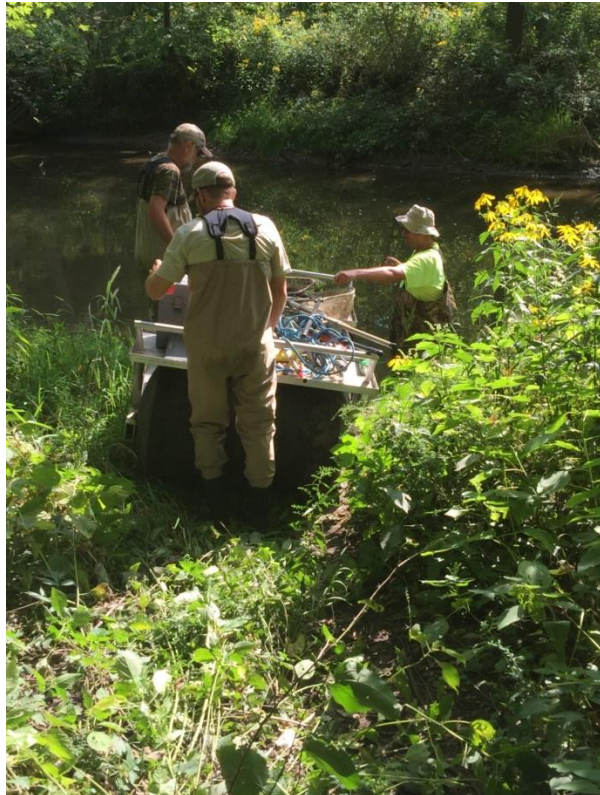
Illinois Dept of Natural Resources and Forest Preserve staff conducted a fish survey at Sannauk Forest Preserve. ....speaking of fish, Northern Pike are caught ( and released ) in the South Branch of the Kishwaukee River in Forest Preserves and other places along "The Kish " in northern DeKalb County