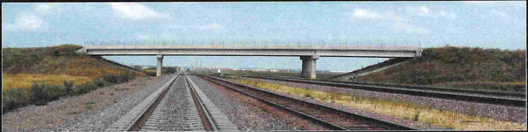
Western Industrial Gateway - Thorpe Road Overpass