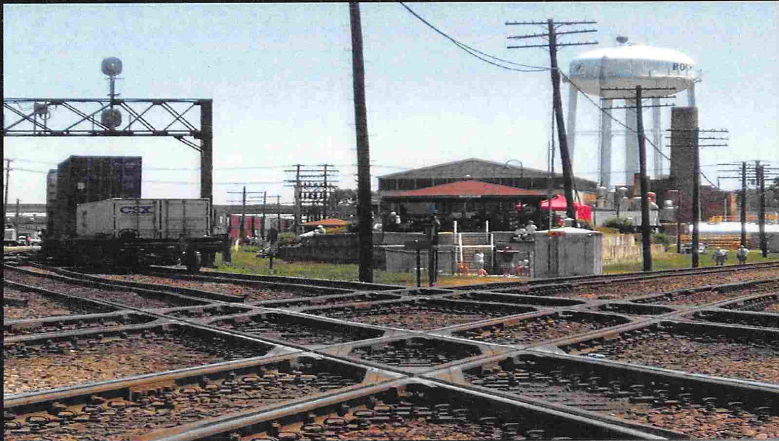
Union Pacific and BNSF Railroad Diamond