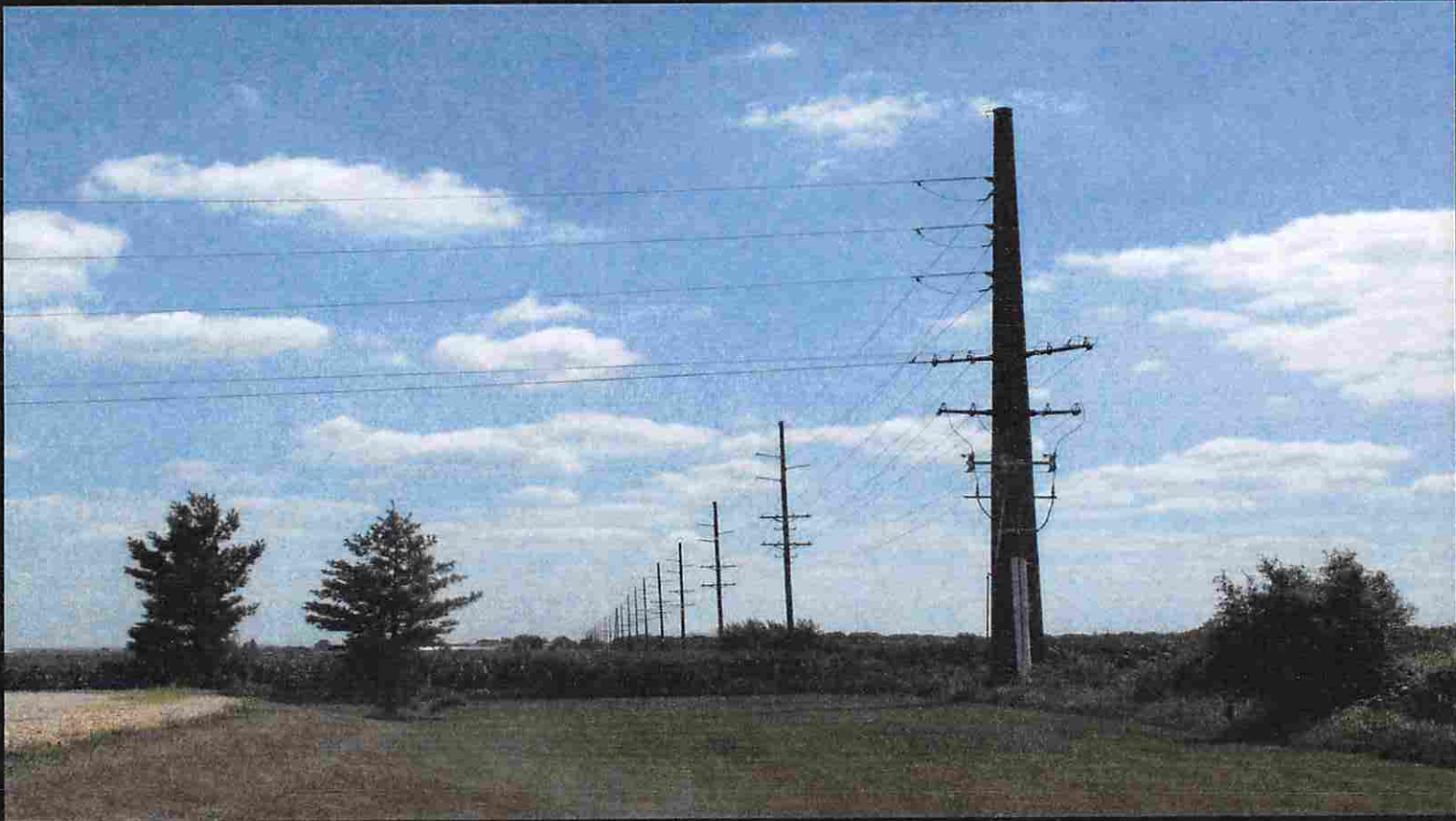
RMU Power Lines to Industrial Sites