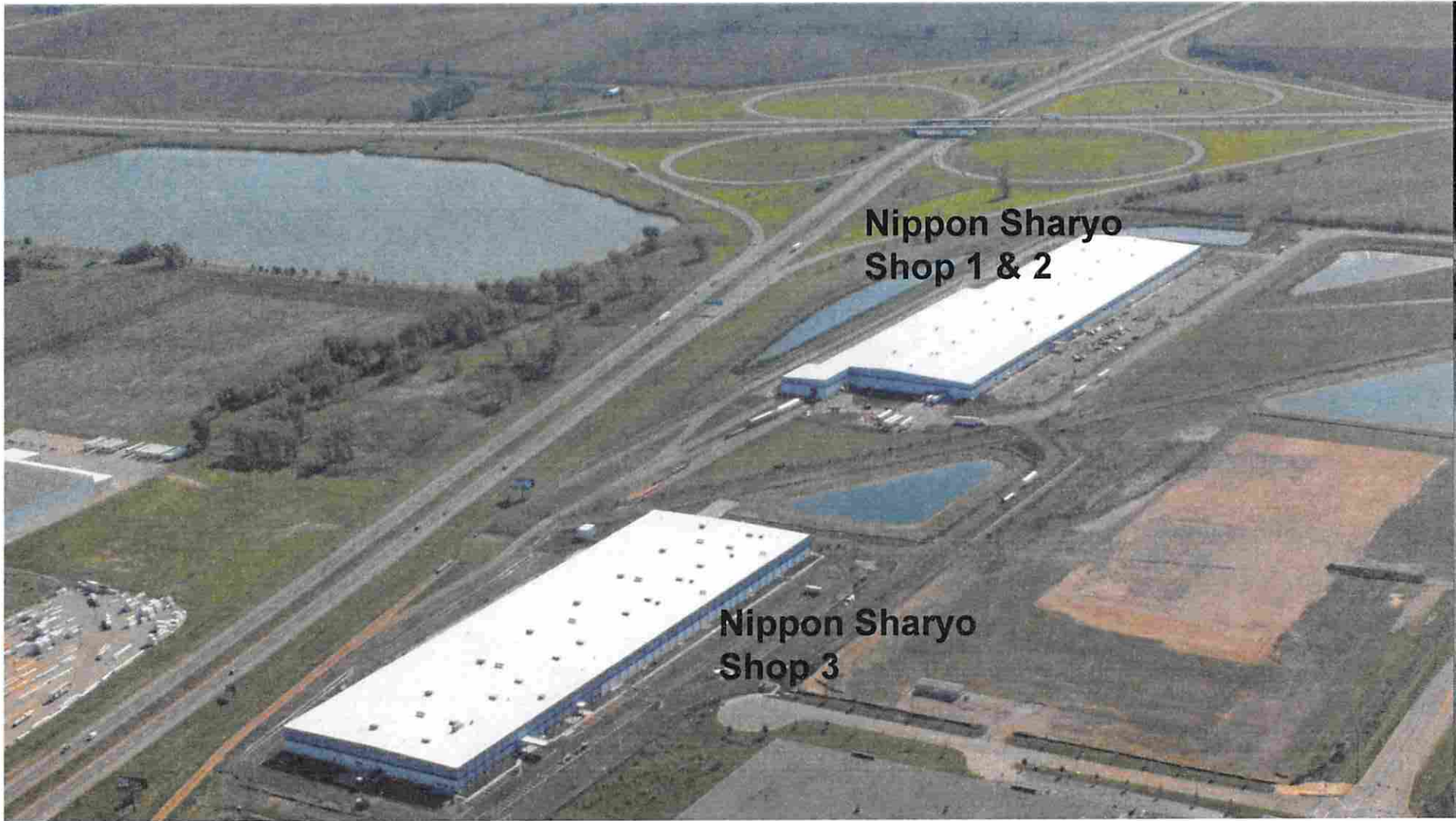
Nippon Sharyo Shop 1 & 2