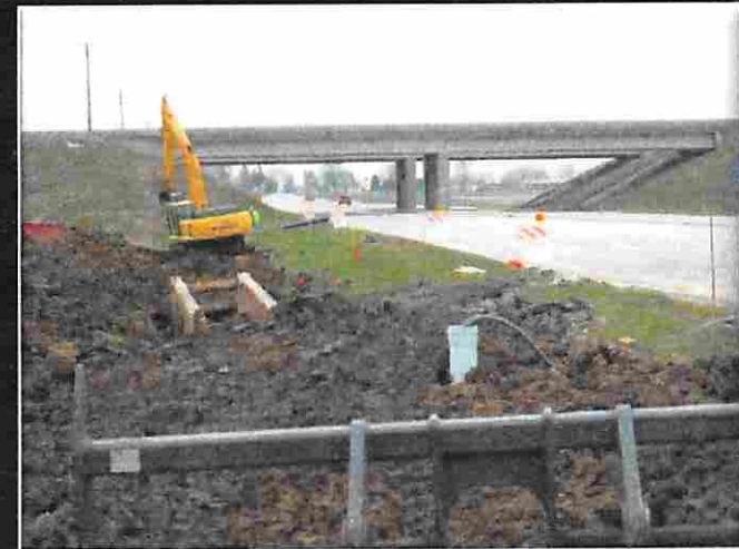
Sanitary Sewer and NICOR Gas