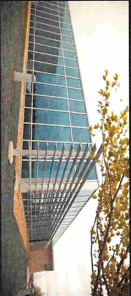
Allstate Data Center