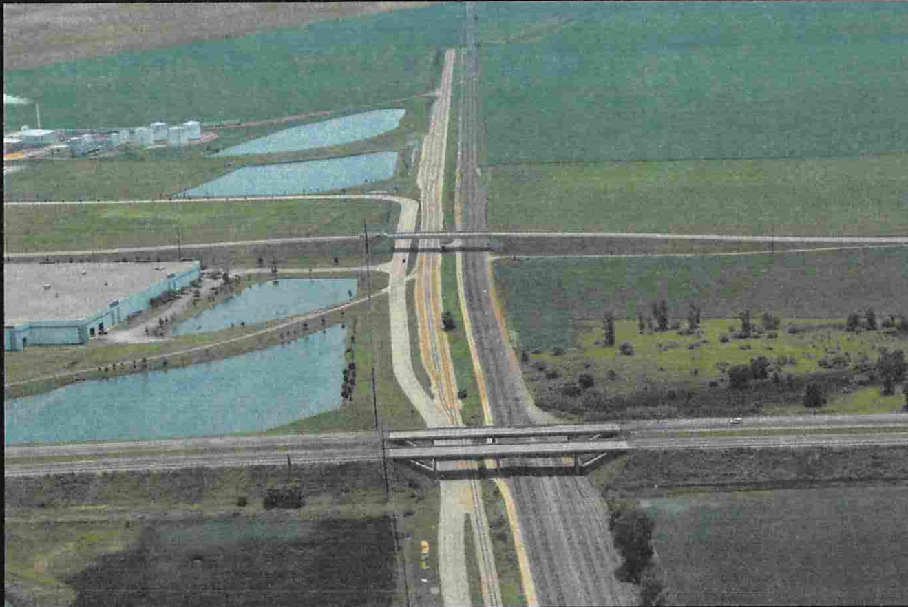
City of Rochelle Railroad