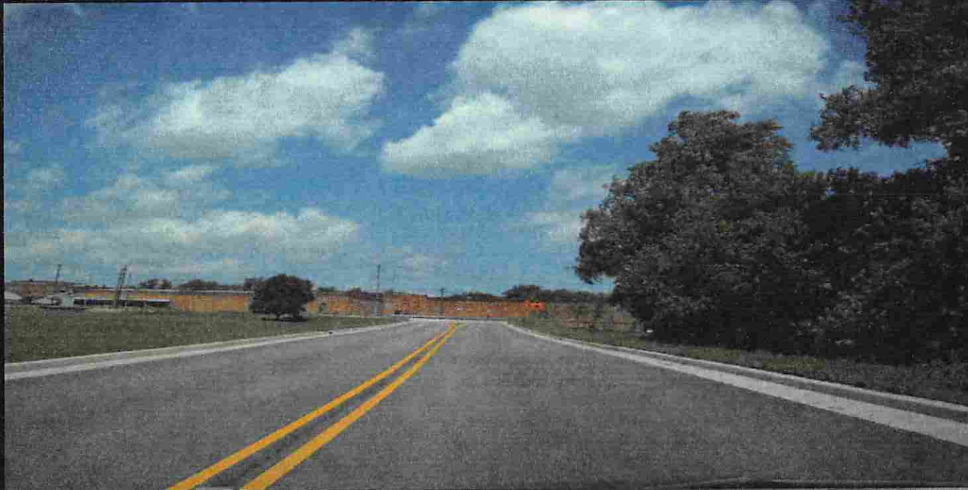
Global III Gateway - Jack Dame Road