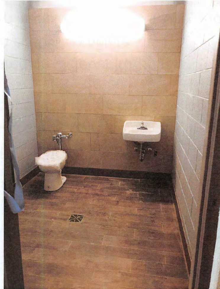
Finish Work on 1 st Floor