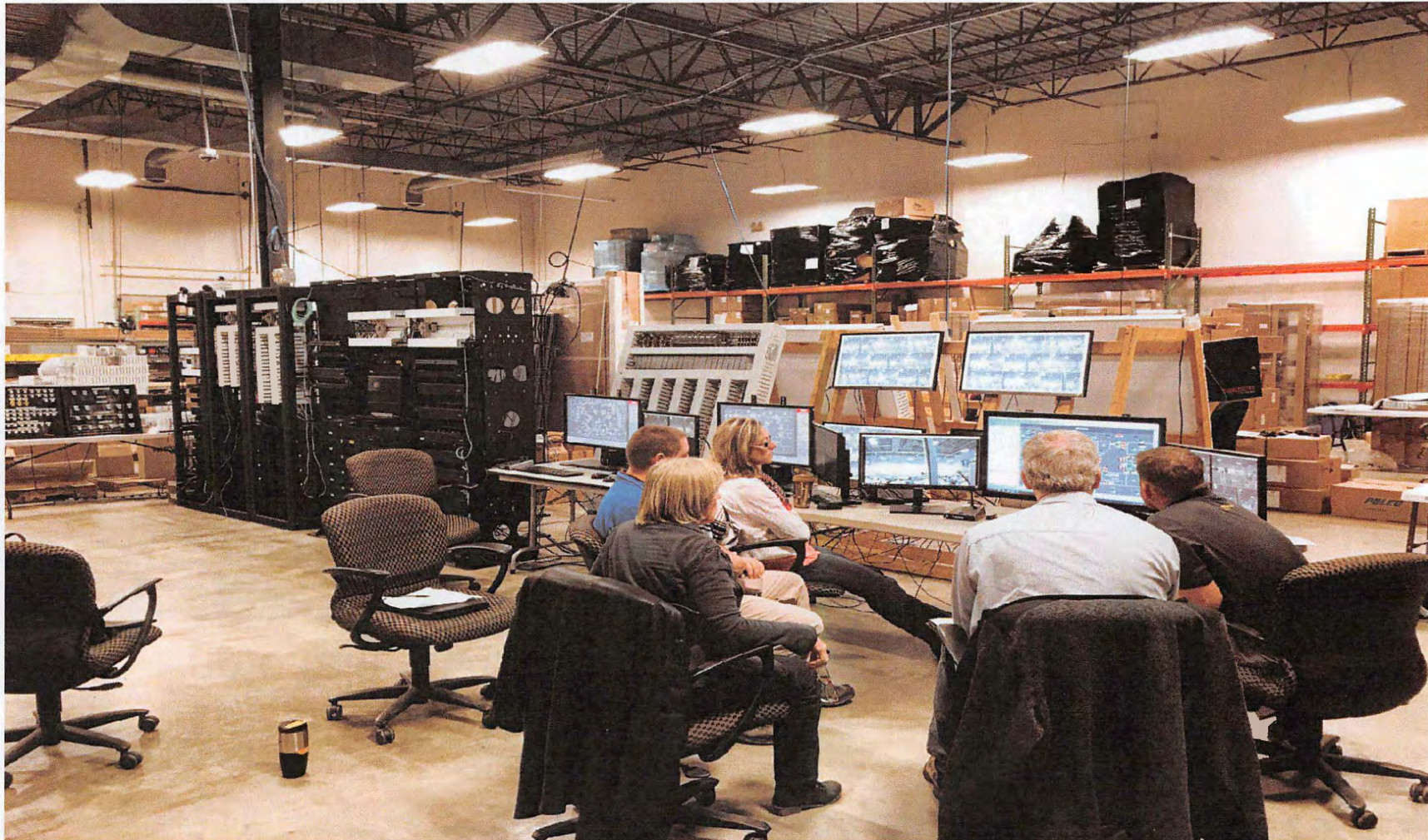
Security System Review Meeting in Indianapolis